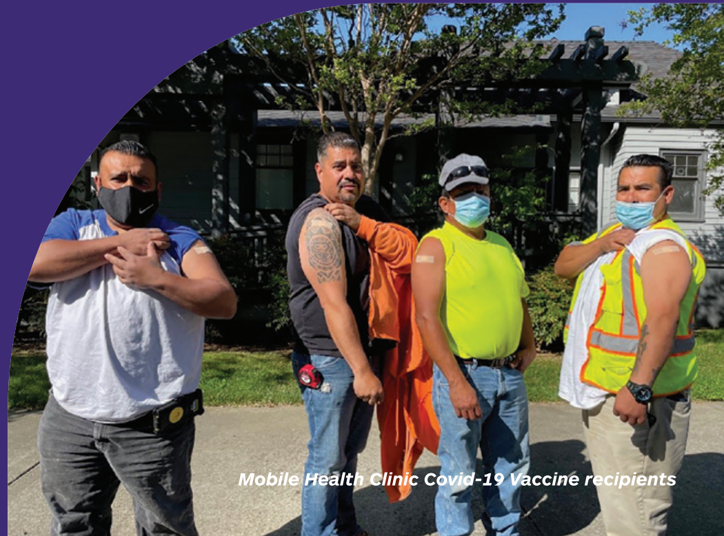
Mobile Health Clinic Covid-19 Vaccine recipients

As a not-for-profit health system, John Muir Health is committed to improving the health of the communities we serve with quality and compassion. We mobilize diverse programs to initiate change through collective action.