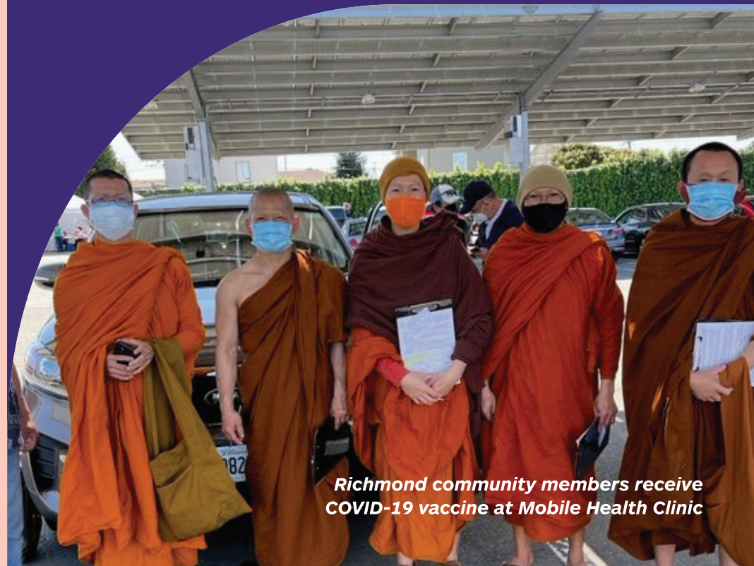
Richmond community members receive COVID-19 vaccine at Mobile Health Clinic

We are proud to support 46 partnerships that serve our community's needs.